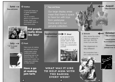
The Midhampton Museum leaflet