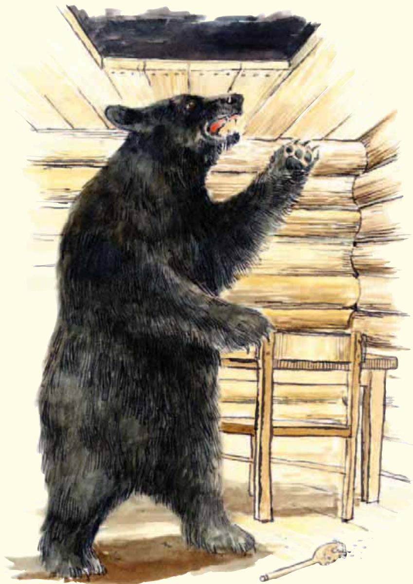
From Lyddie by Katherine Paterson

"Hush," Lyddie commanded. "You'll just make him madder." The cries were swallowed up in anxious gasps of breath. Charles's arms went round the little ones, and Lyddie put a firm grip on her mother's shoulder. It was trembling, so Lyddie relaxed her fingers and began to stroke. "It's all right," she murmured. "He can't reach us."