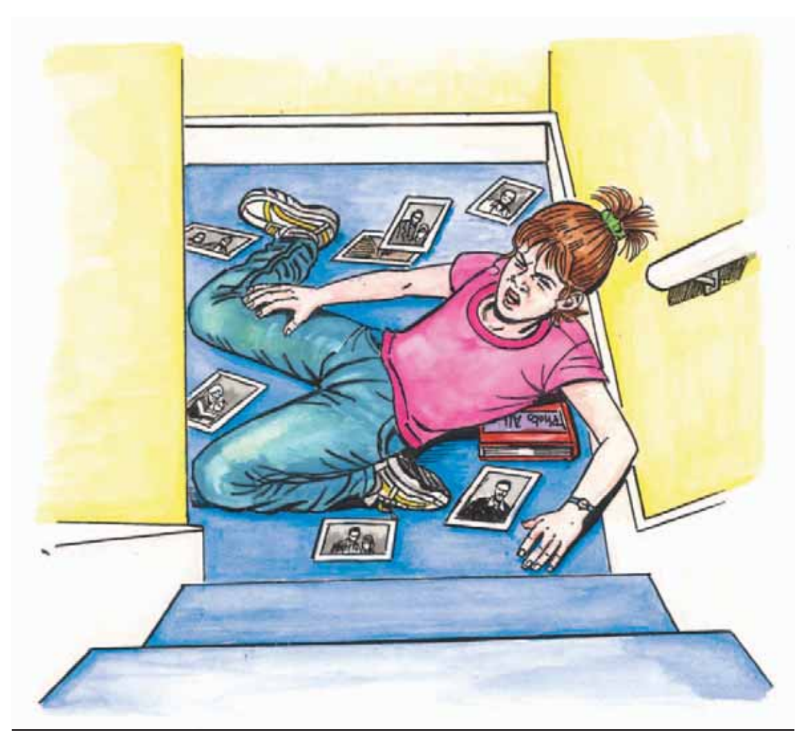
* A stroke is a sudden illness affecting parts of the brain, which can cause speech difficulties and loss of feeling in the body.

'Those who hurry fastest are the first to fall' was one of her Grampa's sayings, and it was as if she heard him saying it now, right out loud in her ear as she stumbled on the top step. Seconds later she landed with a crash at the foot of the stairs. Her head hurt, her bottom hurt and her legs throbbed painfully.