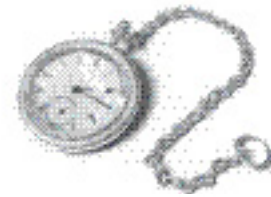
An antique watch

Your task is to write the first two or three paragraphs of a short story, introducing the character.