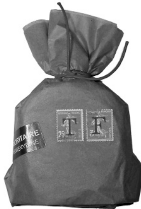
A strange shaped parcel