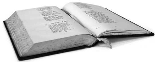
A book of poetry