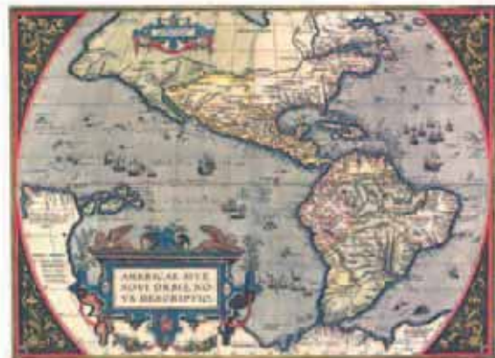
Above: An old map may be the starting point for a lifetime's quest for lost or hidden treasures

Another attraction is the mystery of treasure stashed away and never recovered, for example, pirate gold. Stolen after years of careful planning or taken on the spur of the moment, the treasure had to be concealed and the pirates' tracks covered before it could be retrieved and enjoyed. Often misadventure overtook the pirate before he could return, yet somehow the details of the treasure were passed on, shrouded in ever-greater secrecy.