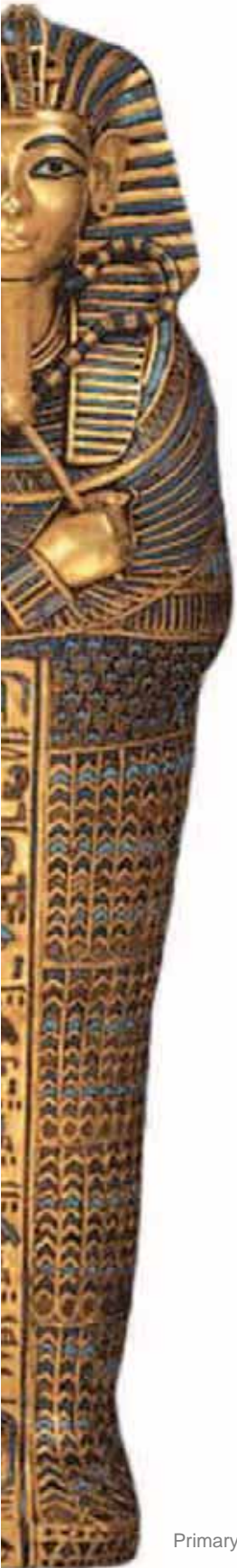
Right: One of the statues found in the tomb