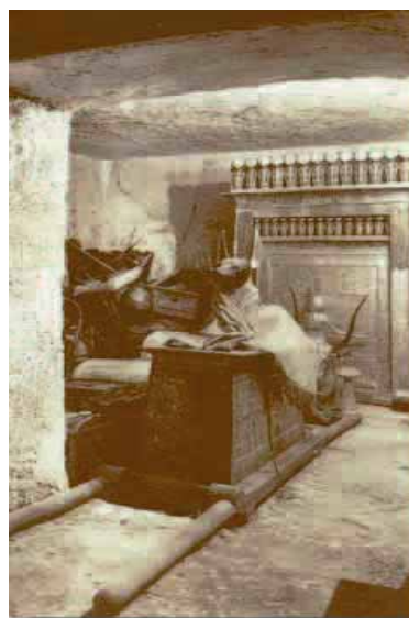
Above: The entrance to the treasury