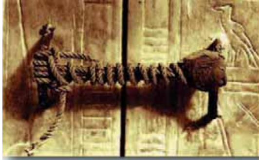
Left: The untouched Burial Chamber seal

Gradually the scene grew clearer, and we could pick out individual objects. First, right opposite to us – we had been conscious of them all the while, but refused to believe in them – were three great gilt couches, their sides carved in the form of monstrous animals with heads of startling realism. Uncanny beasts enough to look upon at any time: seen as we saw them, their brilliant gilded surfaces picked out of the darkness by our electric torch, their heads throwing grotesque distorted shadows on the wall behind them, they were almost terrifying. Next, on the right, two statues caught, and held, our attention: gold-kilted, gold-sandalled, armed with mace and staff, the protective sacred cobra upon their foreheads.