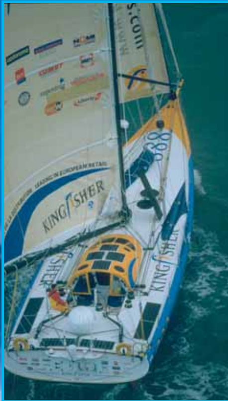
Kingfisher during the race