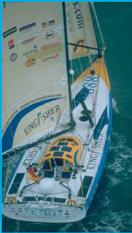
Kingfisher during the race