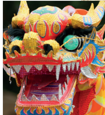
a Chinese dragon puppet

On an island called Jersey, people make giant models of animals, boats and cars out of flowers and take these models on a parade through the island's towns. There is music and dancing. At night, the models are covered in lights and they make the streets sparkle. At the end of the parade, there is a huge firework display.