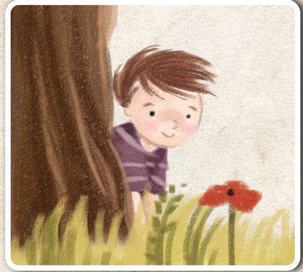
The Hurricane Tree