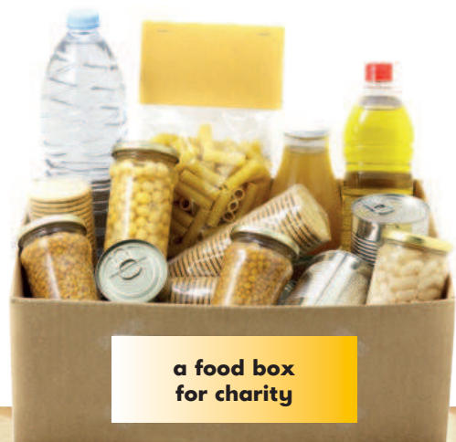
a food box for charity