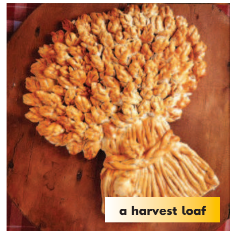
a harvest loaf

Sometimes, bakers will make special harvest loaves. These loaves are shaped like wheat to celebrate the harvest. Wheat is important because it is used in many types of food, including bread.