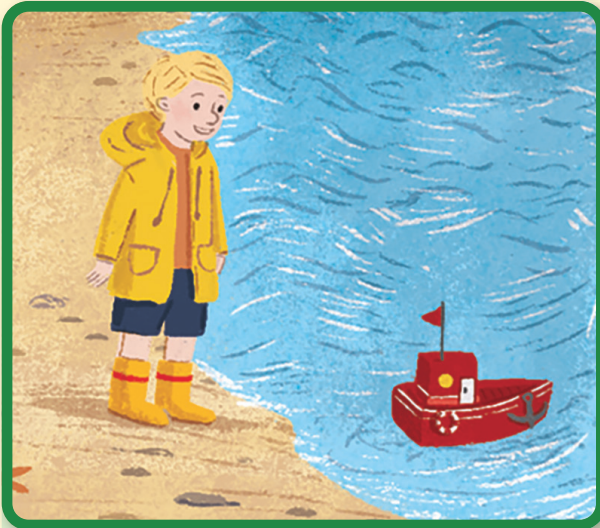
Jack's New Boat