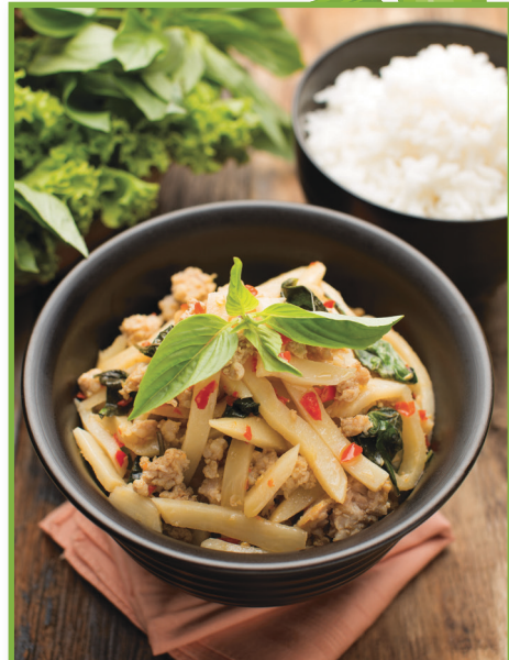
a bamboo stir-fry

We all need to keep our bodies healthy. Bamboo is packed with vitamins that are good for our skin, hair and bones. It's important to cook it carefully because raw bamboo shoots have a poison inside which is dangerous to humans when eaten!