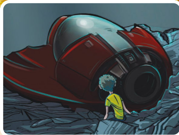
In the Cave