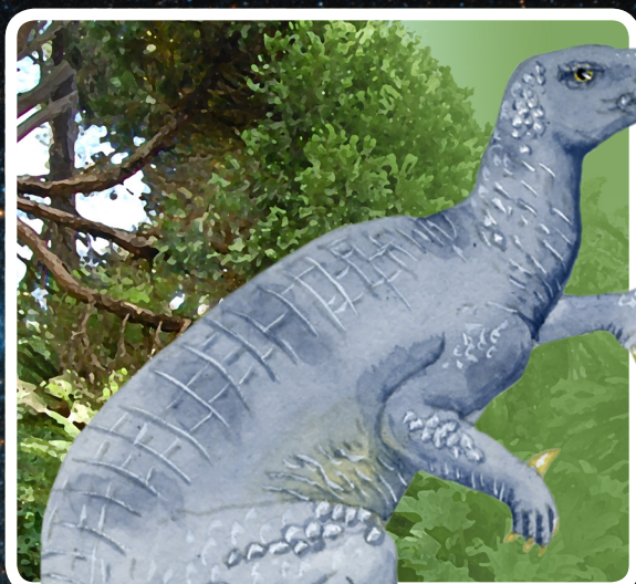
The Lost World